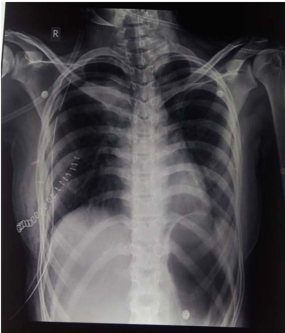
Iranian Rehabilitation Journal