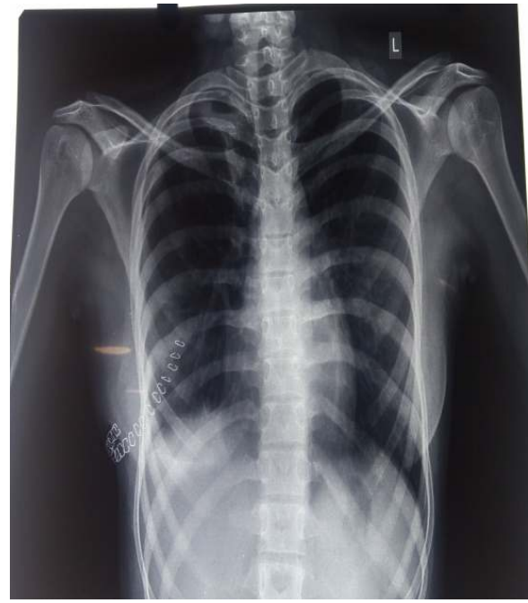
Iranian Rehabilitation Journal

The limitations of this study were that preoperative physiotherapy and physiotherapy management for pain reduction, like transcutaneous electrical nerve stimulation was not provided to the patient. Also, analgesics and their dosage - which had an influence on the pain outcome - were not recorded. Furthermore, the long-term effect of the protocol on the patient was not assessed. Further evidence is required to determine the effect of individualized exercise programs on post-operative pulmonary complications and functional capacity in post-operative pleurectomy and other thoracic surgeries.