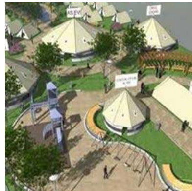
Esenler Earthquake Park