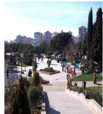
Özgürlük Earthquake Park