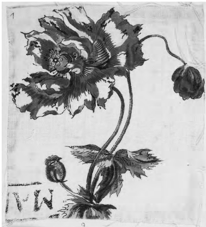
Peonies flower, block printed on cotton, Manufacture Haussmann, Logelbach near Colmar, c. 1780. Courtesy of the Musée de l'Impression sur l'Etoffe, Mulhouse, S.314.1.

ready observed, of all the possible ways of “fashioning” textiles, Europeans had concentrated in particular on weaving and embroidery. Until the late seventeenth century their knowledge of dyes was very limited, and non-existent for reserve dyeing. Painting, another major Indian tradition in cotton textiles, was never seen as a possible avenue for Europeans, as it was very labour intensive. 87 Printing was, however, a much simpler activity based on the engraving of a wooden block and the subsequent impression of the colour or mordant on the textile. Multi-coloured calicoes required a process in several stages with subsequent impressions on the same cloth. 88 Europe’s reliance on printing rather