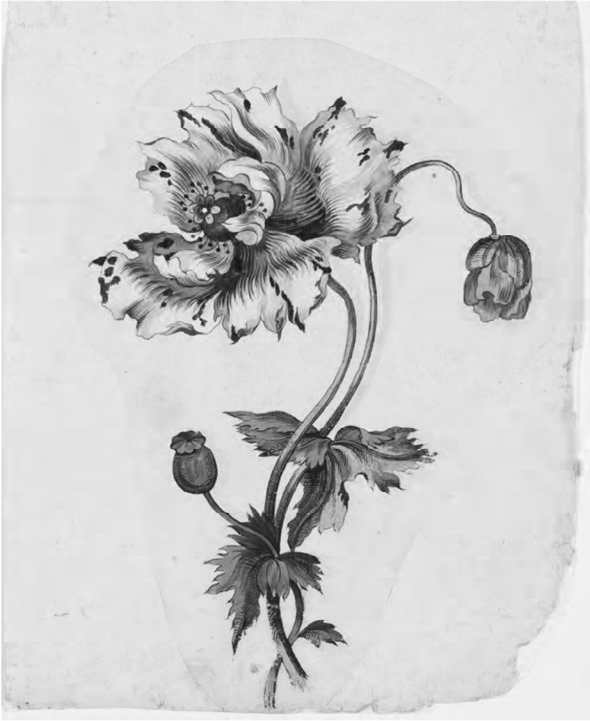
Peonies. Design on paper with gouache, Manufacture Haussmann, Logelbach near Colmar, c. 1780. Courtesy of the Musée de l'Impression sur l'Etoffe, Mulhouse, S.314.1.