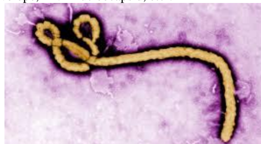
Figure 1: Structure of Ebola virus (Transmission electron micrograph)

The Ebola has characteristic "threadlike" structure, however, a more general morphologic characteristic of filoviruses (alongside their GP-decorated viral envelope, RNA nucleocapsid, etc 7 .