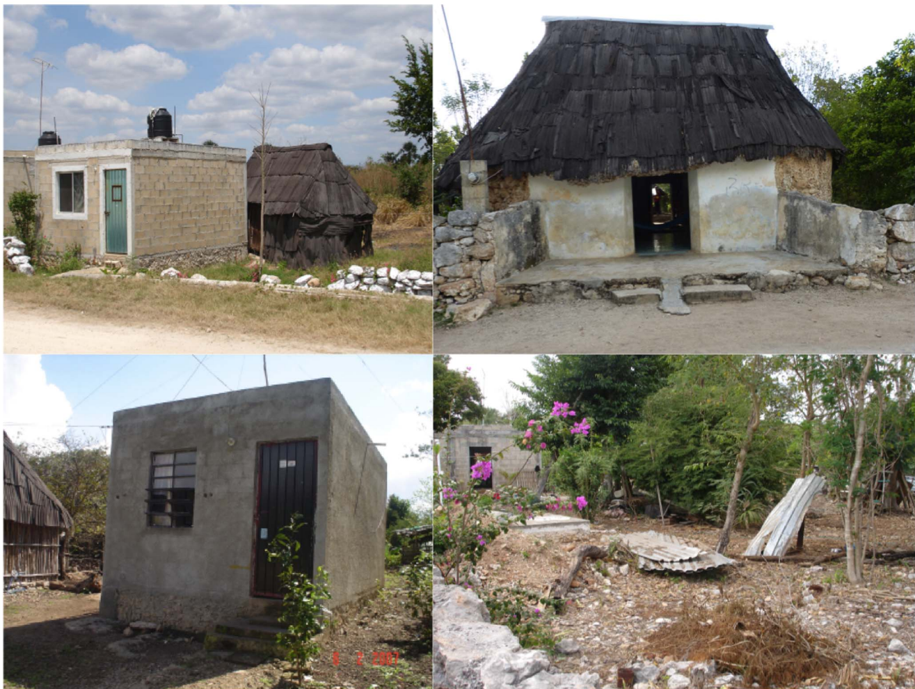
Figure 1. Typical housing and peridomestic structures in rural Yucatan, Mexico.

Houses were surrounded by a peridomestic area of on average 1300 \text{ m}^2 , limited by a fence of piled rocks (84% of houses). Vegetation was scarce close to the house and trees were somewhat denser further from it ( >10 \text{ m} ). Many families kept domestic animals all year round (58%), the most frequent being dogs (52%), chickens (49%), cats (34%), and songbirds (14%). Other animals such as rabbits, pigs, sheep, horses and cows were rather rare ( <3\% ). Animals were usually kept close to the house ( <10 \text{ m} , 83% of cases). Songbirds were kept in suspended cages attached to the fronts of houses, chickens and turkeys were sometimes kept in a corrals/coops (22%), while other animals had free range in the peridomicile. Construction materials were sometimes stored in the peridomicile (25%), while corn or other grains (13%) and firewood (10%) were stored inside the house. The peridomicile area was cleaned at least once a week in most cases (66%), usually by men. About 55% of families used domestic insecticide products such as mosquito coils (45%), plug-in repellents (32%) or spray insecticides (55%) on a regular basis, but only a few (5%) resorted to professional insecticide spraying. Thirty-nine percent of households reported having seen triatomines in their house.