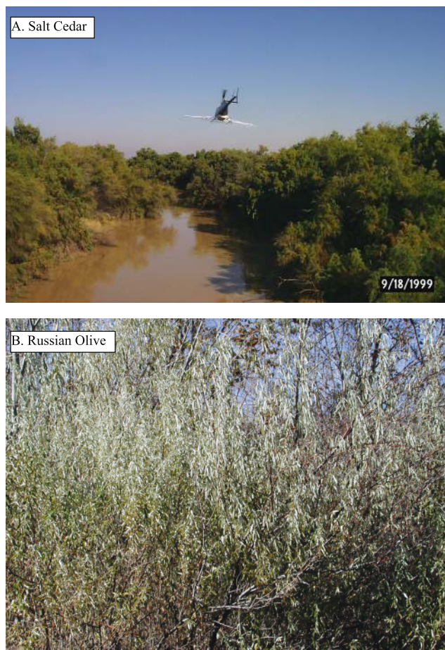
Figure 2. (a) Riparian salt cedar along the Pecos River in Texas receiving herbicide application by helicopter. (b) Russian olive along the Rio Chama, New Mexico. Note the high-density, monoculture habit of both nonnative plant types.

increase in streamflow and groundwater recharge; and under what conditions? How might hydrological factors control the pattern and rate of spread of nonnative species, their interactions with native species, and their ultimate geographical range? How do riparian communities dominated by exotics respond to drought? How do they affect fundamental ecosystem processes, such as primary production, decomposition, and nutrient cycling? Does the establishment of exotic plants alter disturbance regimes (e.g., pest outbreaks, fire) in ways that will modify local hydrology? Such questions can be answered only through coupled studies of the hydrology and ecology of riparian corridors. Indeed, the growing field of ecohydrology could make a lasting and socioeconomically vital contribution to the health of these environments by undertaking studies that focus on nonnative riparian plants.