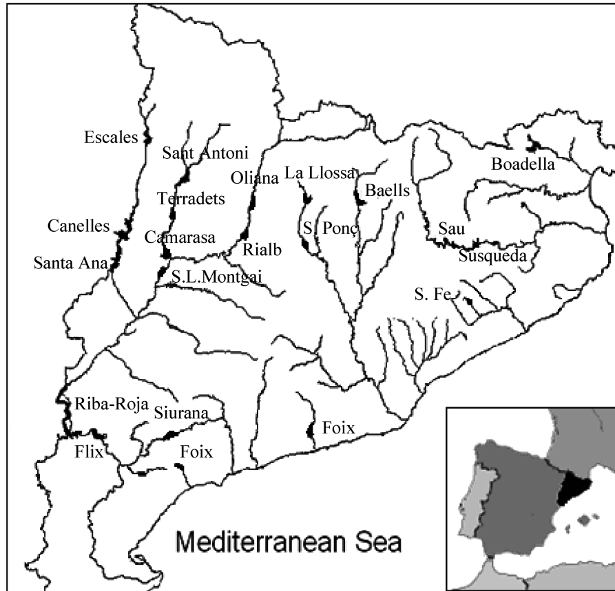
Figure 1.-Study reservoirs in northeast Spain.

short intervals, never more than 50 cm, and the average of the water column was calculated ( \text{mg}/\text{m}^3 ).