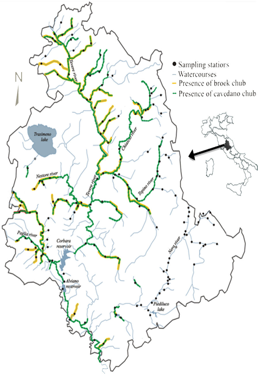
Figure 1 Study area and location of the sampling sites.

stations were sampled 2 times (1 in late spring and 1 in autumn) or 3 times (2 in late spring and 1 in autumn) for a total of 368 observations.