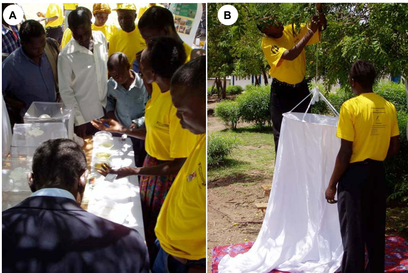
Figure 2 Community members demonstrate the life cycle of mosquitoes (A) and the use of practicable adult mosquito sampling tools (B) at Rusinga Island Child and Family Programme/Christian Children's Fund-Kenya, African Malaria Day, May 2004 on Rusinga Island, Western Kenya.

sustainable changes in behaviour with knowledge transfer from children to adults and between families and friends.