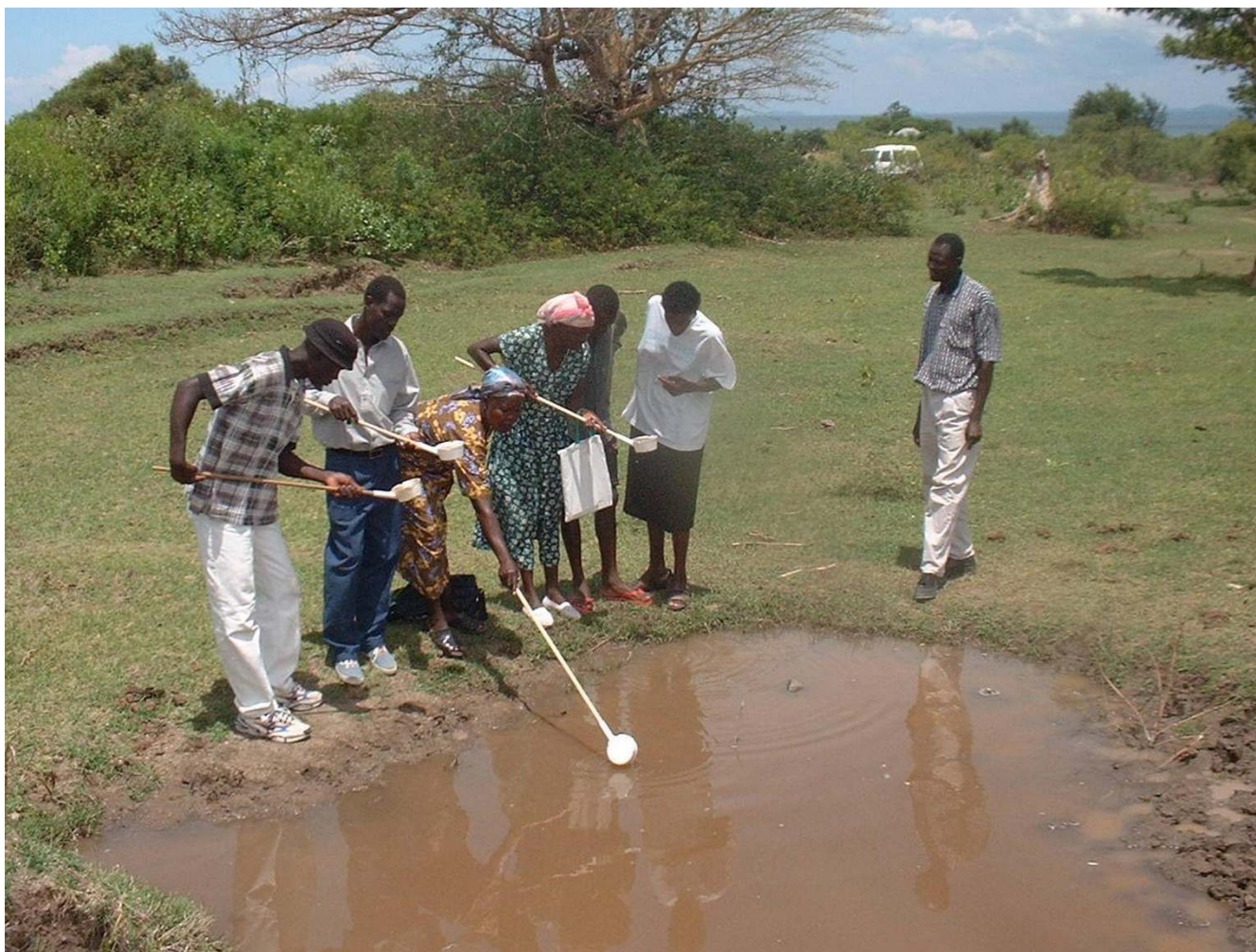
Figure 3 Field training of Rusinga Island Child and Family Programme community volunteers in sampling for mosquito larvae and pupae at Kaswanga, Rusinga Island, western Kenya.

the Teaching Institute for Community Health in Kisumu which continues to train community health workers. Although the academic side of the Rusinga Island collaboration was mainly initiated by international partners directly with the community, this is not a viable mechanism for scaling up to national levels. Therefore, responsibility for running the malaria control project has now been handed over to Kenyan scientists based at the University of Nairobi which acts as the link institute between the international partners and the community on Rusinga (Figure 4). Since then collaborative linkages have been established with a project with similar objectives but different origins in the quite different urban setting of Dar es Salaam in neighbouring Tanzania.