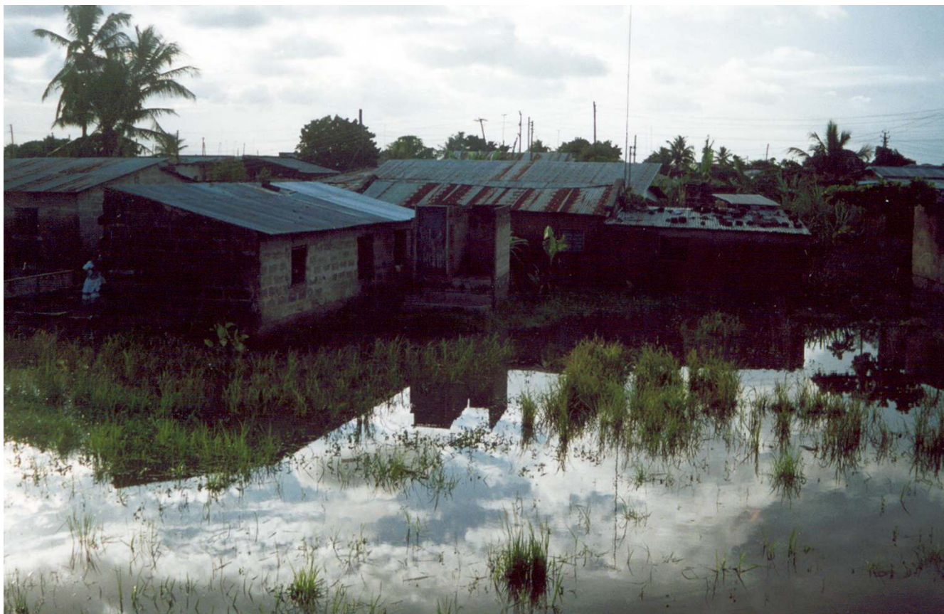
Figure 6 Examples of flooded areas in the poorly planned settlements of Vingunguti in Ilala municipality, Dar es Salaam, Tanzania.

ideal for delivering community-based vector control interventions [15,34,39,87]. This degree of autonomy enabled Ilala Municipal Council to independently conceive, fund and implement a community-based mosquito surveillance programme as an entirely local initiative in early 2002. Supplementing ongoing programmes for social marketing of ITNs and improved access to effective diagnosis and treatment [88], teams of community members were recruited to map and characterize the extensive breeding sites provided by intensive urban agriculture and poorly planned settlement (Figure 6) which abound in Dar es Salaam [76,89] and many other African cities [19,20,90-93]. Weekly surveys for larval and adult mosquitoes were piloted in 7 of the 22 wards of Ilala Municipality as a preliminary step towards IVM by larviciding and environmental management. Furthermore, all three municipal councils had actively promoted a variety of locality-specific community-based environmental management schemes such as trench digging and collection of solid waste refuse to prevent obstruction of such drains (Figure 7). In June 2003 the City Medical Office of Health (CMOH) convened a stakeholders meeting for all con-