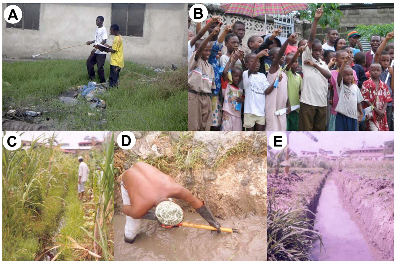
Figure 7 Examples of community-based malaria surveillance and control in Dar es Salaam. A. Community Own Resource Persons mapping and characterizing mosquito breeding sites in Vingunguti ward, Ilala Municipality in May 2004. B. Children participate in a quiz about malaria and mosquitoes in Mchikichini ward, Ilala Municipality, in April 2004. C. Extensive agricultural breeding sites associated with neglected drains adjacent to Ruihinda Primary School (background), Kigogo Ward, Kinondoni Municipality, in June 2001. D. Kinondoni Municipal Council workers rehabilitate the drain to lower the water table in August 2001. E. The same plots in September 2001.

The consensus view of the stakeholders was that it was essential to strengthen the capacity of research and training institutions in Tanzania, within the initial pilot period of the programme, to build the necessary academic support base required to maintain the essential skills base on an indefinite basis. The primary national institutes involved included the Ifakara Health Research and Development Centre and the Department of Zoology and Marine Biology at the University of Dar es Salaam. These institutes were identified as not only supporting institutes but also as targets for strengthening training capacity so that the quantity and quality of applied ecologists available at undergraduate and graduate levels for recruitment to mosquito control programmes could be improved. Although this community-academic collaboration differs considerably from Rusinga in its setting and origins, the partnership has already begun to address capacity deficits by bringing expertise in operational mosquito control to