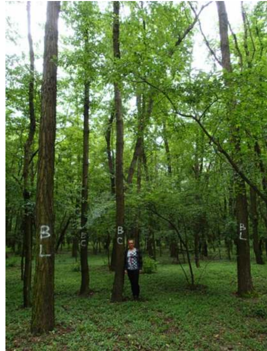
Fig. 2 Mixed black locust (BL)-black cherry (BC) stand in Romania

Protection, either for individual trees or stands using tubes, grids, or fencing (a minimum height of 1.5 m), is recommended in some countries (Austria, Bulgaria, France, Germany), and is necessary when regenerating black locust