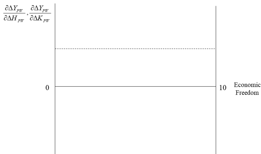
Figure 1. Marginal Effect of Capital on Output Per Worker: Conventional View

The problem with this view – even in a federal system like the United States – is that institutional quality influences both the productivity and allocation of labor. For example, economic freedom has been shown to be related to overall labor market conditions, which would influence both the private and public return on human capital investment. Heller and Stephenson (2014) use data on US states from 1981 to 2009 and find that higher levels of economic freedom are associated with lower unemployment levels and higher labor force participation rates. When paired with the literature showing that economic freedom is related to greater economic dynamism (Barnatchez and Lester, 2017), it is clear that economic freedom influences the number and types of opportunities for individuals in an economy should they want to work for others. 4 For those interested in working for themselves, economic freedom also has a positive relationship with entrepreneurship measures across states (Hall and Sobel, 2008; Powell and Weber, 2013; Shakya and Plemmons, 2021).