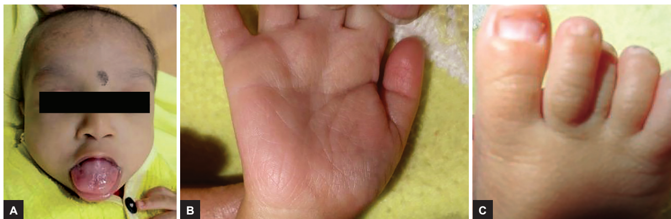
Figs 1A to C: Phenotypic features of the patient: (A) Frontal face with open mouth and protruding tongue; (B) simian crease in right hand; and (C) shorter and elevated second toe and depressed third toe

The science of genetics is relatively a new concept in dental management. However, people have apprehended the heritable nature of traits and have used genetics for thousands of years. Advances in genetic tests have allowed important insights into the nature of disease and facilitated