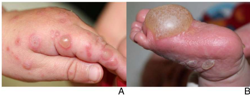
FIGURE 6 A 4-month-old (a) and 15-month-old (b) with confirmed CVA6 infection who presented with acral bullae.