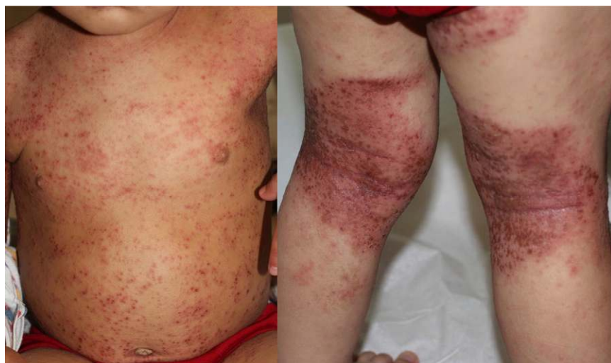
FIGURE 3 Eczema coxsackium: A toddler with confirmed CVA6 infection who had erosions localized to areas of AD.