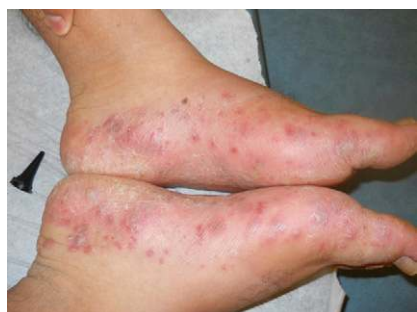
FIGURE 4 A 16-year-old with confirmed CVA6 infection who had purpuric papules and vesicles on the feet.

termed “eczema coxsackium,” (3) an eruption similar to Gianotti-Crosti, and (4) a petechial or purpuric eruption (Table 4).