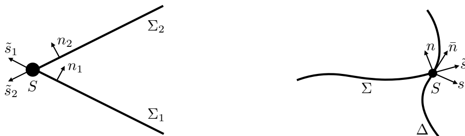
(a) Entangling wedge foliated by space-like Cauchy hypersurfaces \Sigma all joining at the corner 2-sphere S . (b) Time-like boundary \Delta intersecting a space-like Cauchy surface \Sigma at a 2-sphere S .