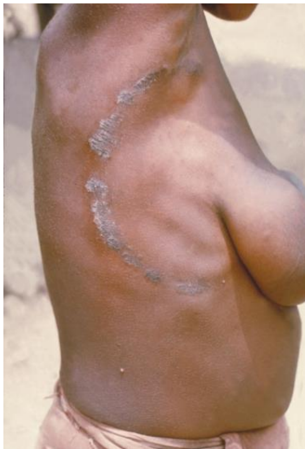
Figure 2. Ringworm on a woman's skin caused by Trichophyton rubrum , a fungus that lives in soil.

Additional research is needed into almost all areas of soils and human health. One of the biggest research needs is an understanding of the complex interactions that take place between chemical species in the soil. For example, Burgess (2013) points out that it is not known whether the mixtures of organic chemicals that end up in soil are creating new, toxic xenobiotics that might be found at very low concentrations but have important health effects on humans and other organisms. Investigation is needed into the ecology and life cycles of human pathogenic soil organisms and the influence of climate change on soils and human health. Less traditional areas that require further investigation are the possible health benefits of contact with healthy soil (Heckman, 2013) and the possible links between organic farming and human health (Carr et al., 2013). In the modern world, the One Health Initiative ( http://www.onehealthinitiative.com/ )