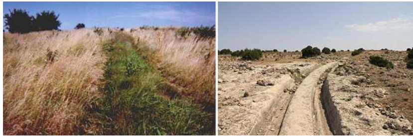
Figure 4. (Left) The Mormon Trail through south-central Iowa, USA. This trail was used by wagon traffic from about 1846 to 1853, but the effects of that traffic are still detectable in the trail's soils. Here the trail appears as a zone of reduced vegetative productivity in this August photograph (Brevik and Fenton, 2012). (Right) A 2300-year-old cart trail at Castellar de Meca in eastern Spain. Traffic from the carts led to the complete removal of the soil at this location.

Western society has largely lost its connection with soils and agriculture, with many children unaware of the source of their food (Bell et al., 2013). Soil and terms associated with soil (e.g., “soiled”, “muddy”, “dirty”) have come to refer to a state of being unclean. This loss of connection is, in part, responsible for the degradation of soils and agriculture in general. Nevertheless, interest in soils and agriculture is rising again (Hartemink, 2008). Communities are forming around urban gardens, schools are establishing student farms, and edible landscapes are considered within urban planning. For soil scientists it is essential to elucidate how we can foster this new trend and develop novel ways that soils and their functions can be integrated into urban life and planning to improve the connection between soils and the urban population. This improved connection would allow for a more pleasant urban environment and improved well-being of its population.