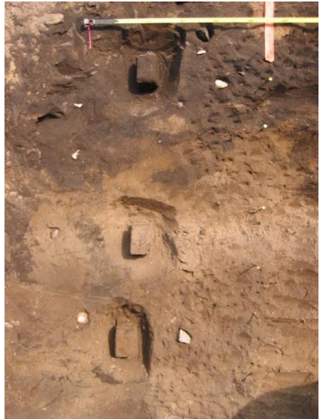
Figure 3. Artifacts within buried soil horizons at an archaeological excavation. The relationship between the soil horizons and artifacts can provide archaeologists with important information. Picture taken near Los Angeles, California, USA.

When considering the introduction of novel, and possibly more profitable, cropping systems within an agricultural landscape, the availability and distribution of different soils needs to be considered (Yi et al., 2014). Similarly, when new policies are devised to address environmental impacts, soils must be considered (Mérel et al., 2014). In recent years, several studies have linked biophysical and economic model-