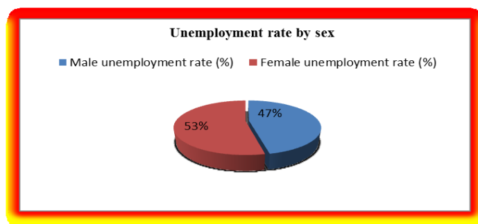
Fig. 1. Unemployment rate by sex 2016 in Hunedoara County

In table 3 we can see that in 2016 the unemployment rate was 5.79%, one of the largest in Romania, yet it is gratifying that there is a decrease in the unemployment rate compared to 2015 by 0.09%. According to employment workforce agency statistics, Hunedoara has over 10,789 unemployed. The restructuring of the mining sector increase the unemployment since the area is one mono industrial, and all related activities are related with mining.