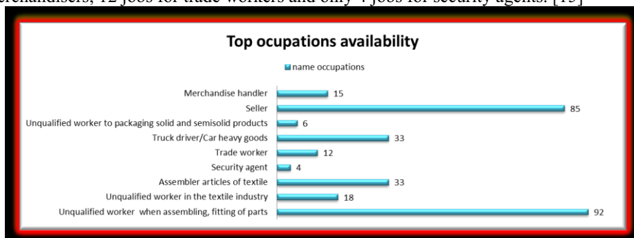
Fig. 4. Top occupations availability in Hunedoara County in 2017

According to statistics dated 22/02/2017 provided by the Local Agency for Employment Hunedoara, we can observe in figure 4 that most vacancies are for unskilled workers at assembly, fitting parts with 92 positions, after which the top closest followers vendors with 85 positions, truck driver with 33 positions, just as many places available for textile articles assembler, 18 jobs are granted to unskilled worker in the textile industry, 15 jobs for merchandisers, 12 jobs for trade workers and only 4 jobs for security agents. [15]