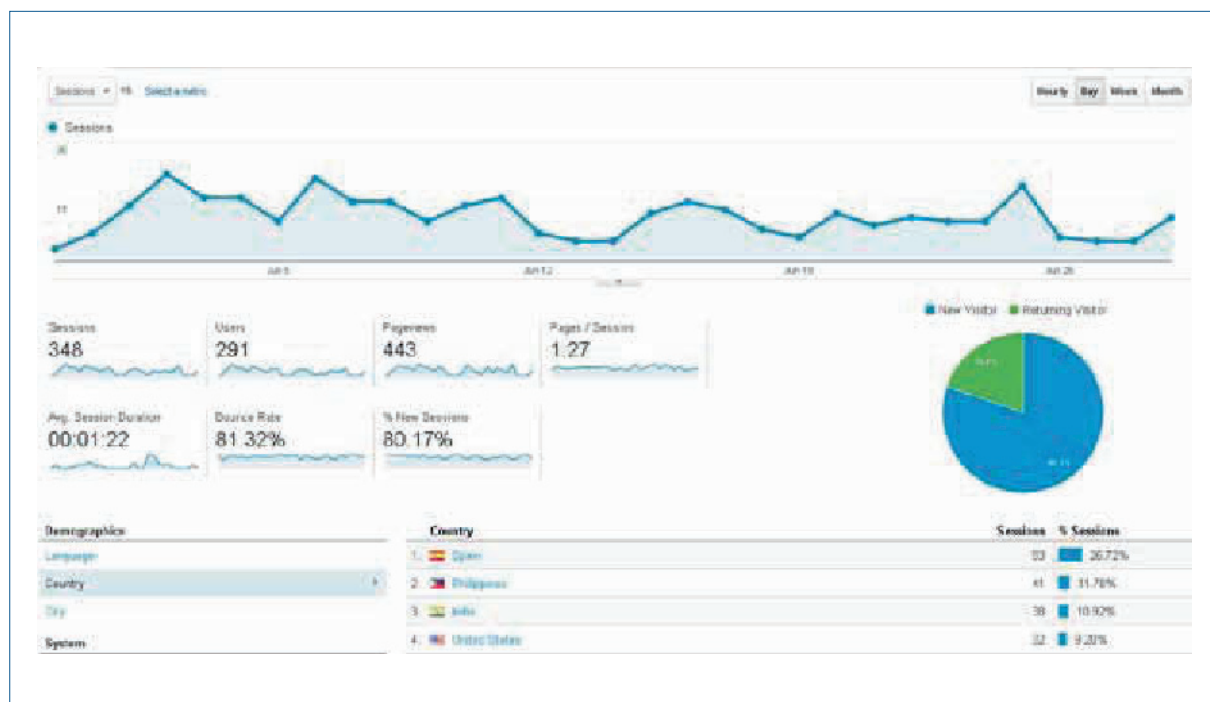
Figure 2. Example of a Google Analytics report

While most LMSs incorporate their own tools to automatically generate customizable statistics reports of course development, these are often quite basic. For instance, Moodle ( https://moodle.org/ ) allows several types of report to be generated: (a) logs for selected activities, students, items and periods of time; (b) live logs, which include recent activity; (c) activity reports, presenting the numbers of views of each activity in a course; (d) course participation, analyzing the actions of selected students for a given period and activity; and (e) data on activity completion. Blackboard ( http://es.blackboard.com/sites/international/globalmaster/ ) also offers several types of report, e.g., (a) user activity overview, which displays overall system and course activity for all students; (b) user statistics, consisting of the average number of students and other users per month and per day; (c) user activity in forums; and (d) user activity in groups. Another interesting tool that can be easily employed is Google Analytics (Figure 2). It can provide information about the number of visits, pages visited, the average duration of each visit, demographics, etc. Regarding monitoring student activity and performance, Lera-López, Faulin, Juan, & Cavaller (2009) review the tools provided by Sakai, WebCT/Blackboard and Moodle.