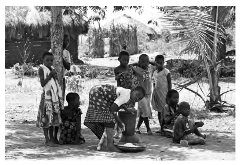
Figure 7: Despite few direct school literacy materials, homes were still full of vibrant contexts of socio-cultural knowledge that could be tapped into for school literacy