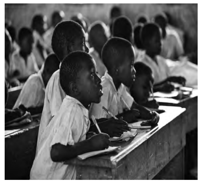
Figure 3: Writing in exercise books – children with inadequate space due to crowding

Under these conditions, facilities and materials were not always ideal – being inadequate in some and completely missing in others, all leaving the children unable to consistently conceptualise the link between the activities of reading and writing and the school structures. Throughout, literacy texts such charts were not a common feature of the classroom walls and talk around texts was usually absent, factors that severely limited literacy development opportunities for children in these contexts. The extent of barriers to literacy development was mainly due to children missing out on constructive literacy practices - not having undertaken constructive written work in their exercise books up to the end of year and missing out on opportunities to develop texts themselves. The classrooms for the visually impaired had different attributes from the other ordinary classrooms. It was noted that the school with the special visually impaired section was better resourced than other schools although they also needed more. The head teacher revealed that it was a beneficiary of the Roman Catholic Mission of which it was part and, as a result had access to adequate resources although they needed more. Visually impaired teachers taught this class and each child had adequate resources to use - each, their own special typewriter