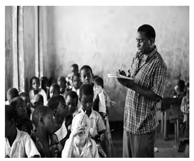
Figure 5: Challenging teaching and learning conditions for literacy development

Even with available teaching materials, teaching remained patchy with no full sentences on the board or full phrases based on prepositions as teaching points.