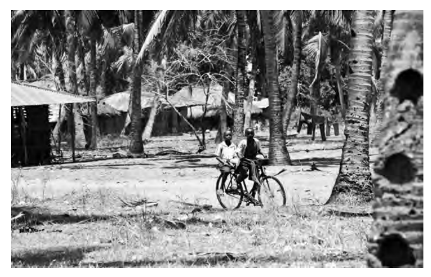
Figure 6: Clustered linear structure – these are not conditions where reading and writing can be central