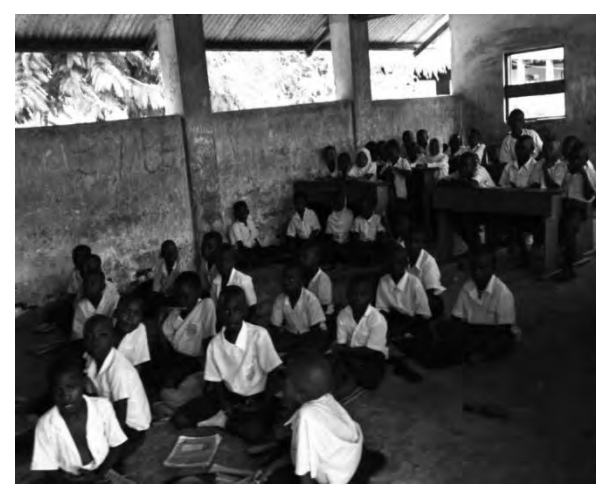
Figure 1: A classroom in which half the children had to sit on the floor and the other half on benches