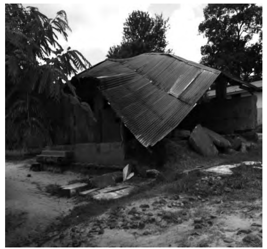
Figure 2: A collapsed school building. Fortunately nobody was hurt in this incident (illustration of the level of neglect)