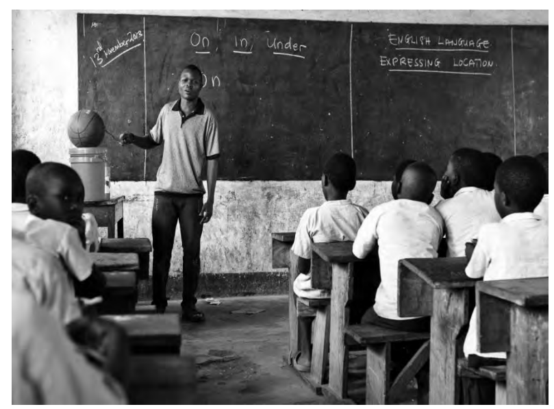
Figure 4: Literacy practices challenged

Even with available teaching materials, teaching remained patchy with no full sentences on the board or full phrases based on prepositions as teaching points.