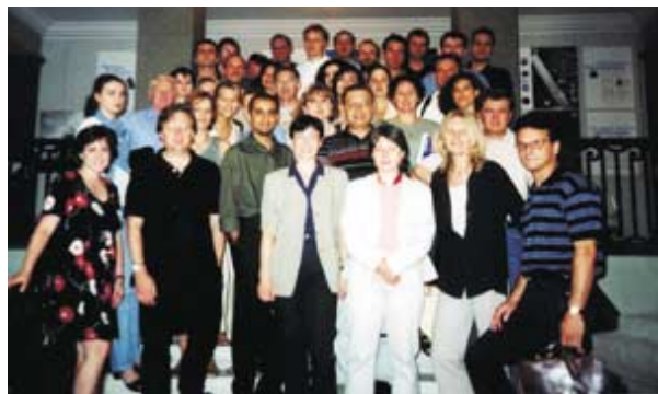
Figure 7. Participants and teachers of the second workshop on Communication in Biomedicine, Rijeka, 14-16 June, 2001.

Preventive measures take time, and the first results of the undergraduate teaching of scientific method and writing will be visible after many years. Author-helpful policy of the journal reaches a number of physicians who constitute the current body of medical research community. However, those who would benefit most