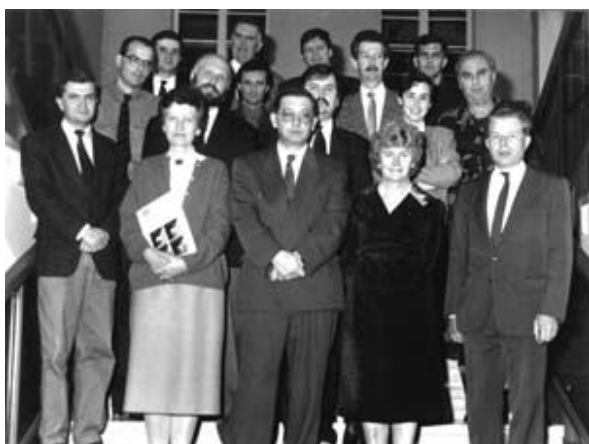
Figure 3. The first Editorial Board of the Croatian Medical Journal . The photograph was taken in November 1991, during an air-raid alarm, at the main stairs of the Zagreb School of Medicine. At that time, we had so much work that we did not think of going down into the basement shelters.

Working with many Croatian professionals from different fields of medicine, we learned that they had enormous experience and very important data, but little or no knowledge of how to present them to the international medical community. Through helping them to publish their results in the CMJ , we instituted an author-helpful policy (7,8), which became our