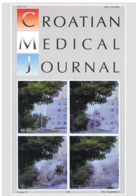
Figure 2. The first publication of the Croatian Medical Journal – War Supplement . It came out in 1991, before the publication of the first regular issue in 1992. The cover page shows air-attack on the Health Center in Vrlika, a small town in the hinterland of the city of Split on the Adriatic coast, on August 26, 1991.