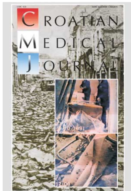
Figure 4. The second War Supplement, published in 1992. The photograph in the background of the front page is the Vukovar main street. The insets are a video tape reconstruction of a 250 kg airplane bomb that penetrated six floors of the Vukovar Hospital on October 5, 1991. Luckily, the bomb did not explode.