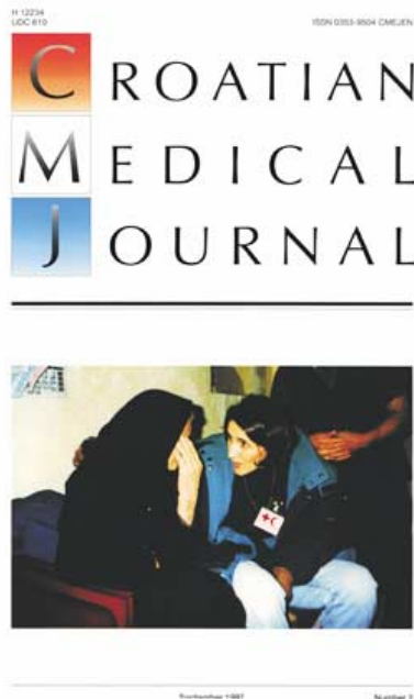
Figure 8. The first thematic issue, on aging. The issue was a part of an international effort, led by the Journal of American Medical Association (JAMA) to publish a global theme issue. Ninety-seven journals from 31 countries participated in the effort. The front page brings a photograph of a Red Cross worker interviewing one of the thousands of elderly people abandoned during the flight of local Serbian population during the military "Storm" action in 1995 (21,22).

Preventive measures take time, and the first results of the undergraduate teaching of scientific method and writing will be visible after many years. Author-helpful policy of the journal reaches a number of physicians who constitute the current body of medical research community. However, those who would benefit most