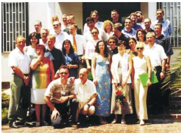
Figure 6. Participants and teachers of the first Workshop on Communication in Biomedicine, Split, 13-15 June, 2000. The first workshop was sponsored by the British Council and the Croatian Ministry of Science and Technology.

After the war, we were able to put more effort into our educational activities (Fig. 5), beside following the author-helpful policy. We realized that what was needed for the advancement of science and scientific communication in Croatia and other countries from the scientific periphery was education in the principles of scientific research and writing, which should start as early in the academic life as possible. Four members of the editorial board and teachers at the Zagreb School of Medicine, with the support of the School's administration, introduced a mandatory course for the second-year medical students, "Principles of Scientific Research in Medicine". The course teaches what is scientific research, how it is done in medicine, how information can be found in medical literature, and how to write a scientific article. The course has been included in the curricula of medical schools at other three Croatian Universities, and we see it as a public health preventive measure to increase the competence of future medical researchers. Students are also encouraged to do and publish their own research. We followed the tradition of the StudentBMJ (26) and last year published a special section of the CMJ dedicated to research performed either on or by the students. This issue brings the second edition of the student section – the interest of students is growing and we get more and better articles.