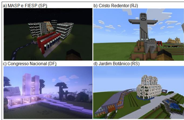
Fig. 1. Representation of constructions made by students.

of representations and constructions, a compilation of a few student's productions is exposed here.