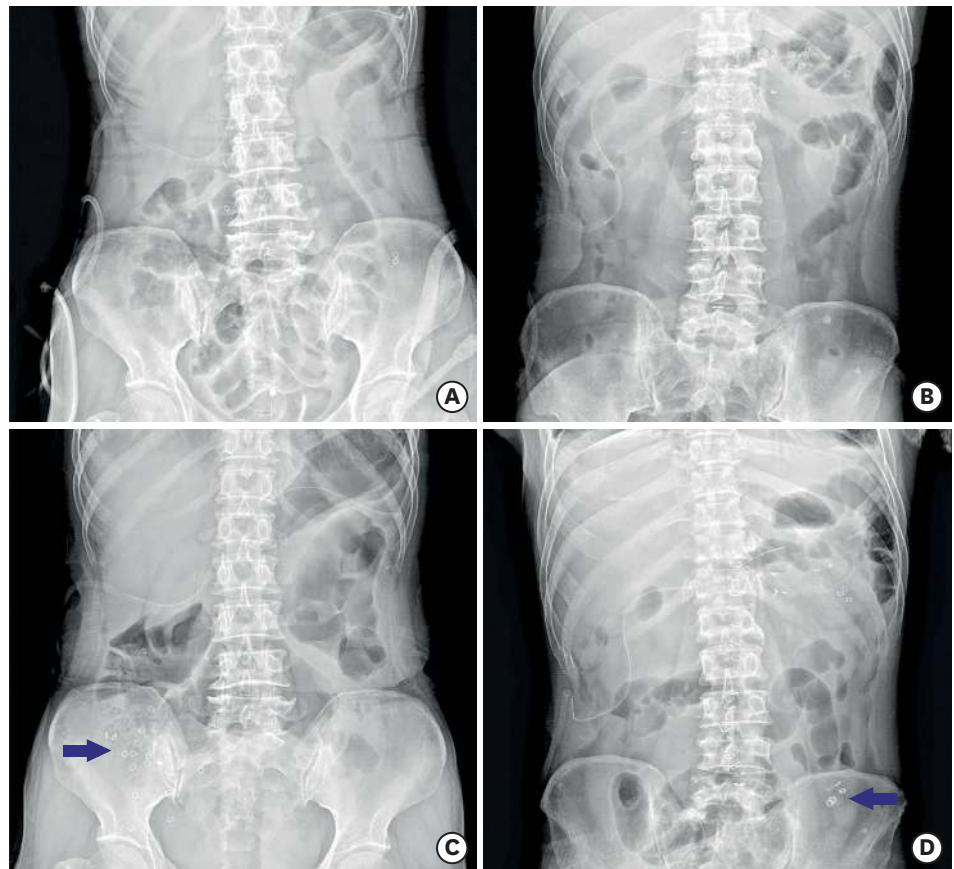
Fig. 1. Remnant sitz markers in the small intestine on abdominal radiograph of patients in the A and NA groups. (A) Patient in the A group have more sitz markers in the small intestine on postoperative day 1. (B) Patients in the NA group also have more sitz markers in the small intestine on postoperative day 1. (C) Most of the sitz markers (arrow) have passed through the IC valve by postoperative day 3 in patients in the A group. (D) Some migration of sitz markers (arrow) in the small intestine is detected on postoperative day 3 in patients in the NA group, but none have passed through the IC valve. A = acupuncture; NA = non-acupuncture; IC = ileocecal.