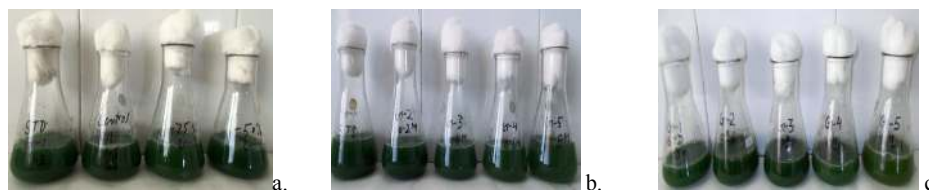
Figure 2: Effect of Carbon content (a), Salinity (b) and pH (c) on Growth, Chlorophyll-a, Carotenoids, Phycocyanin, Allophycocyanin and Phycoerythrin content of S. platensis .

had shown significant difference in content of phycocyanin (PC) as compared to standard. G-6 (0.4 M salinity) had shown very significant higher content of phycocyanin i.e. 6.01 \pm 0.44 followed by G-2 (-100% carbon deficiency) i.e. 3.60 \pm 1.00 , 4.72 \pm 0.97 in G-10 (pH 7) as compared to standard G-1 (pH 9) i.e. 4.13 \pm 0.26 . The minimum amount of PC was found in G-12 (pH 11) i.e. 1.37 \pm 0.13 as compared to standard (Figure 1,2a-2c).