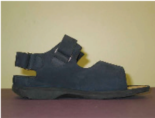
Figure 1. Standardized sandal.

The participants wore standardized sandals (Figure 1). All these sandals had a hard 1 cm thick sole, with a leather lining and a heel rise of 1 cm. Different sized sandals were used during the stability assessment depending on the size of the feet of the participants. The insoles were flat and off-the-shelf. Patients were provided with the insoles and the measurements were performed.