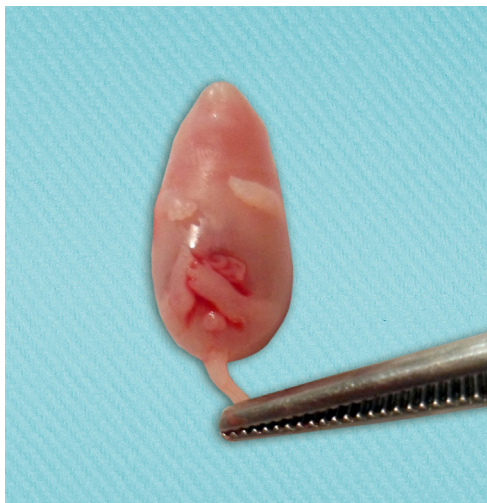
FIGURA 3 - ARM ADR induced, limb and facial defects – ADR group.

Some others anomalies were observed. Limb and facial defects, coexisting or not with ARMs, were observed in both groups. There was no significant difference ( p > 0.05 ).