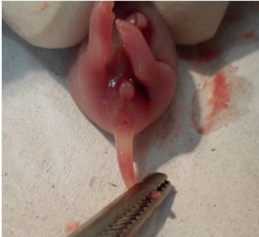
FIGURE 1 - No ARM – AF + ADR group.