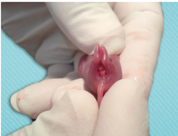
FIGURA 2 - ARM ADR induced – ADR group.