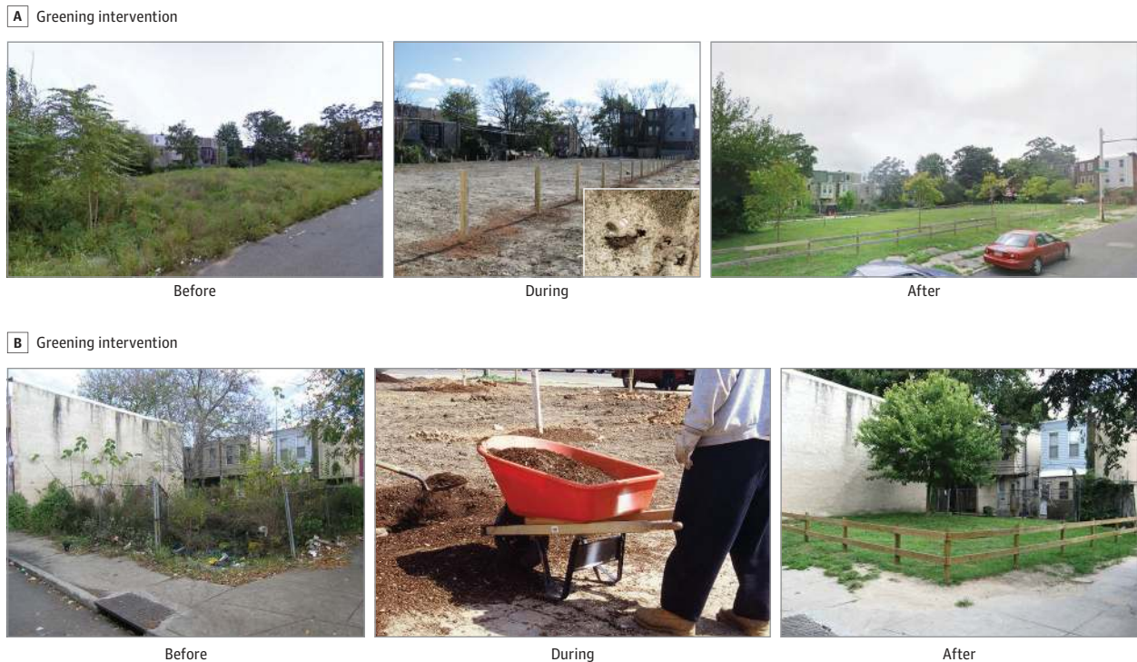
Figure 2. Vacant Lot Main Greening Intervention

Images show blighted preperiod conditions and remediated postperiod restorations. A, The image shows the grass seeding method used to rapidly complete the treatment process. B, The after image shows the low wooden perimeter fence. Vacant lots shown