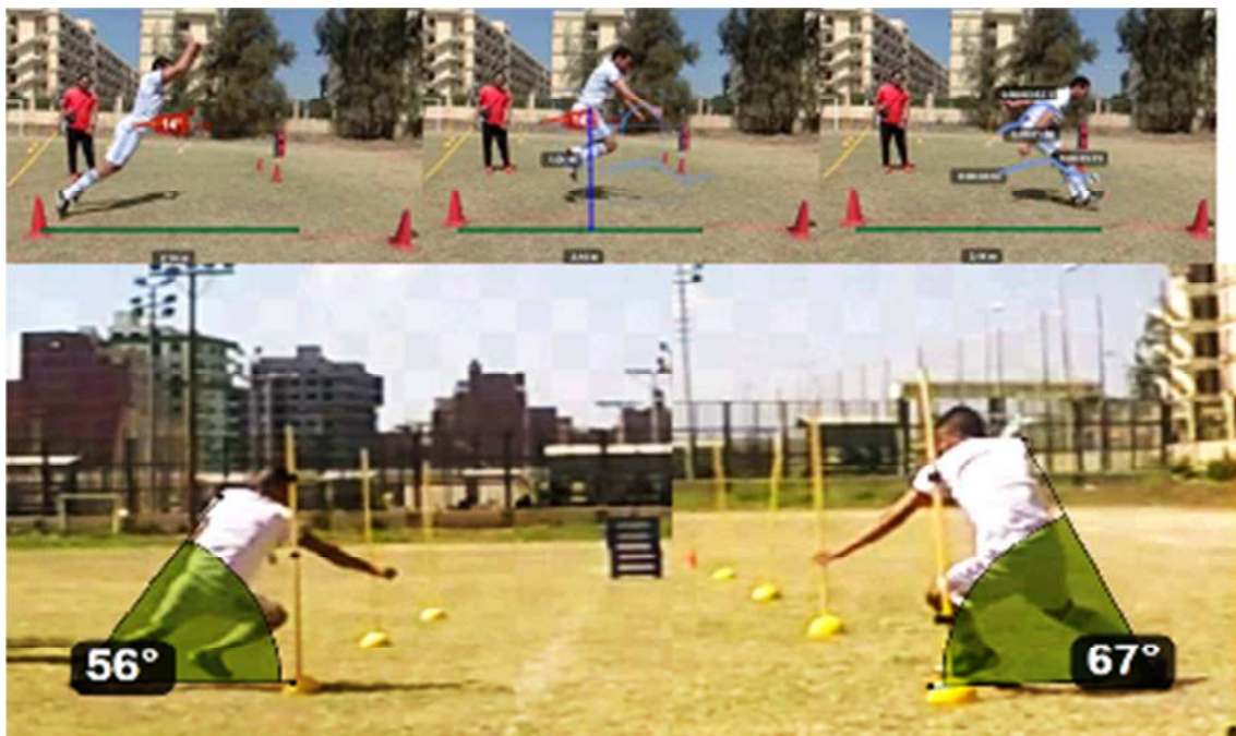
Figure 3. Kinematic analysis of horizontal jumping and agility test variables.