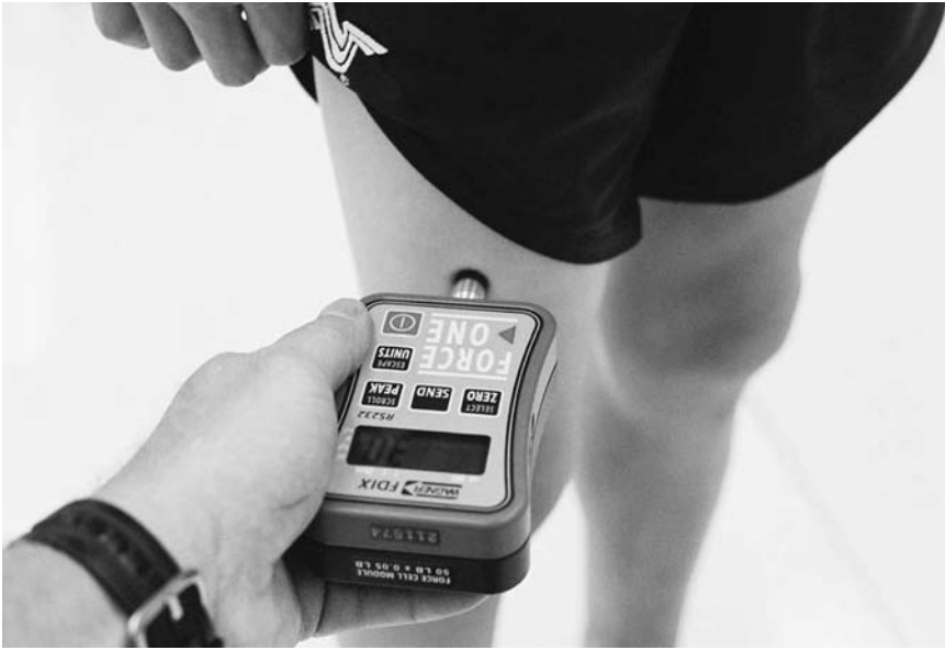
Figure 4 — Algometer placement for vastus lateralis measurement.