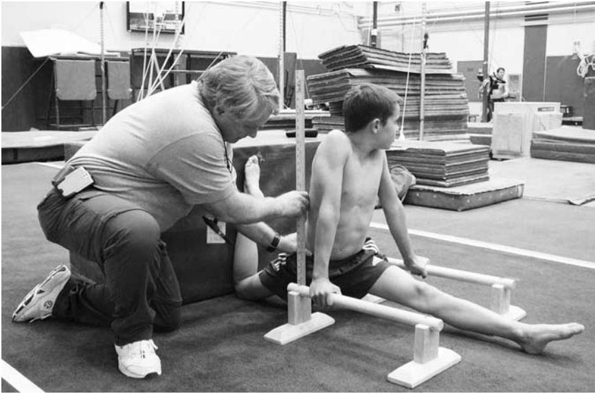
Figure 1 — Test position; measuring the height of the anterior superior iliac spine.