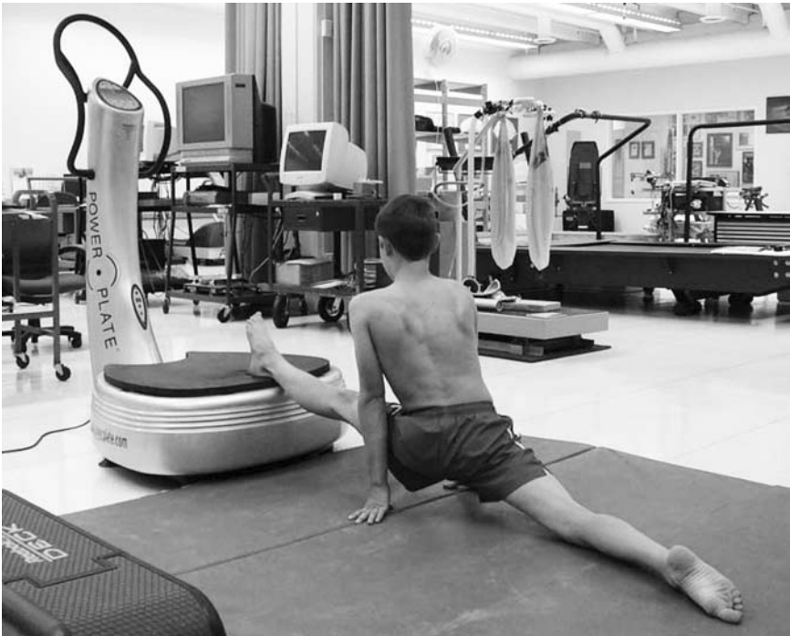
Figure 2 — Split treatment; forward leg of the split on the vibration device.