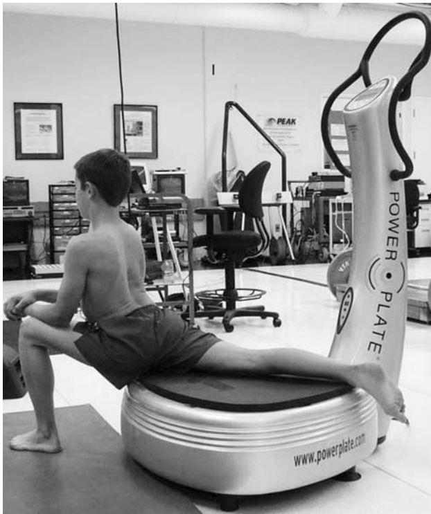
Figure 3 — Split treatment; rear leg on the vibration device with the gymnast leaning backward.

Pressure-to-Pain Threshold. The pressure-to-pain threshold was measured via an algometer (Force One, FDIX 50, Wagner Instruments, Greenwich, CT). The algometer is a handheld device with an integral load cell that transduces the pressure applied to the subject through a 0.11-cm-diameter round solid contact surface attached to the load cell. The algometer had a capacity of 222.4 N (50 lb), mass 0.4 kg, and dimensions of 70 mm × 100 mm × 30 mm. Sampling was set at 100