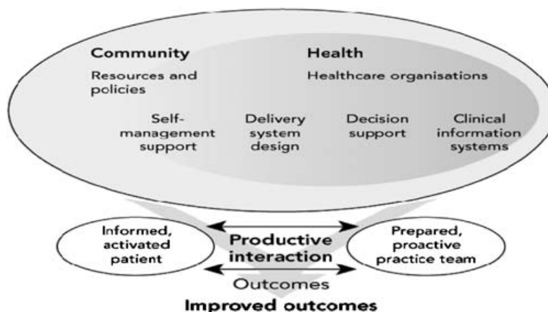
Figure 1 The chronic care model (CCM) (Wagner, 1998). Reproduced with permission from the American College of Physicians.

care system, there are four components at the practice level: self-management support, delivery system design, decision support and clinical information systems. A higher level component, organization of health care, plays an overarching role to guide practice-level development. A broader component, the community, provides necessary resources and policies linked to chronic illness care. The development and integration of these components is seen to foster productive interactions between prepared, proactive health providers and informed, activated patients. As a result, patients' outcomes are expected to be improved.