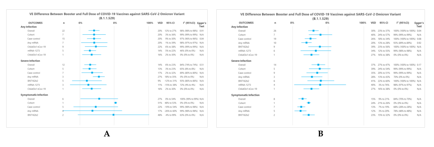
Figure 2. Forest Plot summary representing VED between the booster and a full dose of COVID-19 vaccine against SARS-CoV-2 infections. Panel ( A ) and ( B ) show subgroup summary of VED 'within 3 months' and 'within 3 months or more' models, respectively.

Results from two meta-analysis models, i.e., the 'within 3 months' (Figure 2A) and 'within 3 months or more' (Figure 2B) models, were compared. In the 'within 3 months' model, there were 22 separate analysis data involving any mRNA vaccines (n = 7), BNT162b2 (n = 9), mRNA-1273 (n = 5), and ChAdOx1 nCov-19 (n = 1). Meanwhile, in the 'within 3 months or more' model, we obtained 26 separate analysis data that involved any mRNA (n = 10), BNT162b2 (n = 9), mRNA-1273 (n = 6), and ChAdOx1 nCov-19 (n = 1). As a comparison between these two models, pooled results of the 'within 3 months or more' model generally had a higher VED, both for any infection or severe infection.