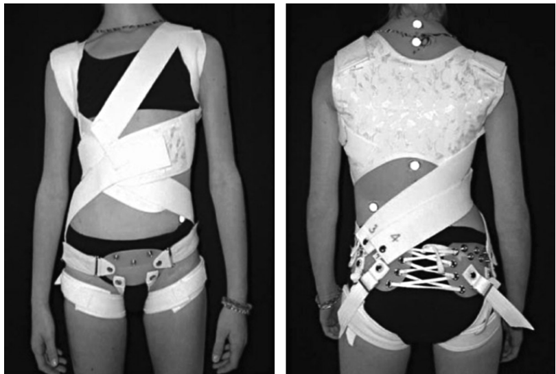
FIGURE 2. Front and back views of the SpineCor brace fitted for the right thoracic type 1 curve: the brace keeps and stimulates the specific corrective movement for the right thoracic curve.

Improvement of more than 5 degrees or stabilization of \pm 5 degrees of the scoliosis curvature was defined as a positive outcome. An aggravation of the spinal curvature of more than 5 degrees, progression exceeding 45 degrees, withdrawal, and surgery were defined as negative outcomes. The data collected were analyzed in 4 outcomes, as suggested by the SRS Committee on Bracing and Nonoperative Management. 9 To strengthen the ability to compare and combine results