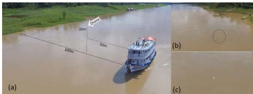
PLATE 1 (a) The positions of the boat and the drone during surveys of the Juruá River (Fig. 1). (b) Pink river dolphin detected by the drone. (c) Detail of animal detected in (b).

Small multi-rotor UAVs were chosen because of their vertical take-off and landing capability, which was required