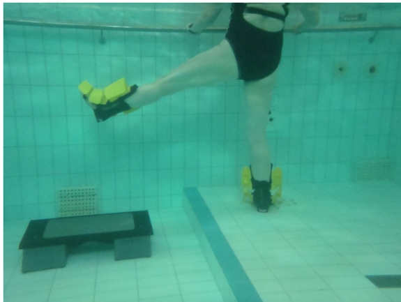
Figure 2 Hip abduction/adduction in standing.