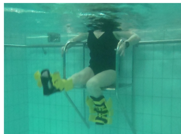
Figure 5 Knee flexion/extension in sitting.