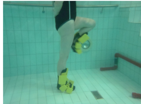
Figure 4 Knee flexion/extension in standing.

every training session immediately after the main set before the cool down. All sessions will be supervised by 2 experienced physiotherapists, who had been trained to instruct these aquatic programmes and accredited for life-saving before the trial began.