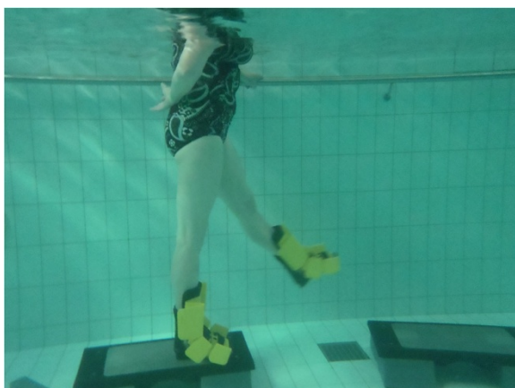
Figure 3 Hip flexion/extension in standing.

Weeks 1–2 is an introductory period to allow subjects to become familiar with the movements with sets of 45 - seconds duration per leg per set with no resistance i.e. barefoot. Weeks 3–5 will consist of alternate trainings of 30 or 45 seconds with small fins (THERABAND PRODUCTS, The Hygienic Corporation, Akron, OH 44310 USA). Weeks 6–8 will be 3 week period with 45 seconds of work alternating sessions with small aquafins and large resistance boots (Hydro-Tone hydro-boots, Hydro-Tone Fitness Systems, Inc. Orange, CA 92865–2760, USA). Weeks 9–11 and 13–16 will consist of alternate trainings with