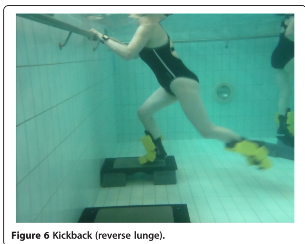
Figure 6 Kickback (reverse lunge).

work of 30 and 45 seconds with large boots. Week 12 will consist of one session barefooted, one with small fins and one with large boots, work duration will be 45 seconds per set. The frontal area of aquafin resistance fins is 0.0181 m 2 and that of the large resistance boots 0.075 m 2 . In a previous study the drag experienced during seated aquatic knee flexion/extension exercises in healthy women was triple with the large boots compared to the barefoot condition. Additionally, a significant increase in EMG activity was seen with the large boots compared to no boots [117,122].