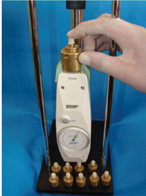
Figure 2. Special pressure device to apply standard cementation force during setting of cement.