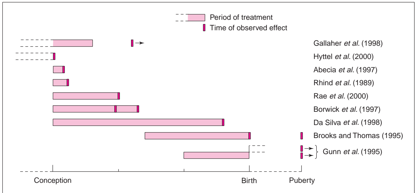
Fig. 1. Periods of development in sheep, cattle and pigs during which nutritional manipulations have been applied (light pink) and stages at which effects on structure or function of the reproductive system have been identified (dark pink).

1996; Crisp et al. , 1998). Thus, it is likely that adult reproductive performance reflects the combined effects of multiple factors as diverse as nutrition, stress and EDC exposure, during prenatal development.