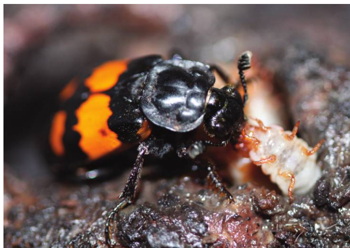
A female burying beetle ( Necrophorus vespilloides) feeding predigested carrion to a begging larva.