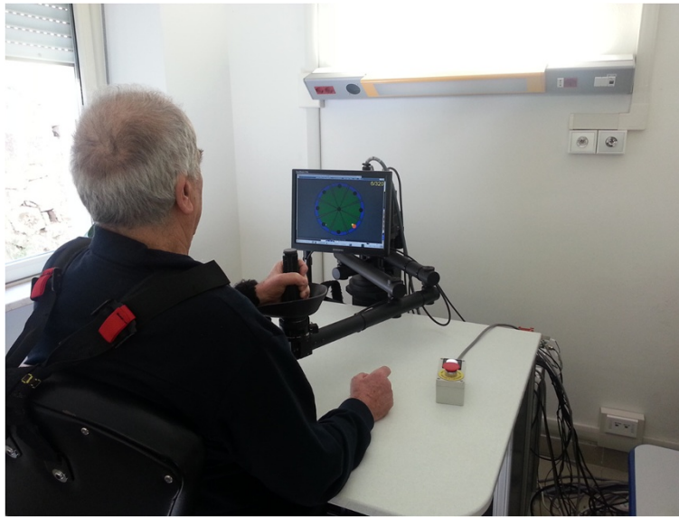
Figure 1 Experimental setup.

assessors at the beginning (T0), after 15 sessions (T1), and at the end of the treatment, after 30 sessions (T2).