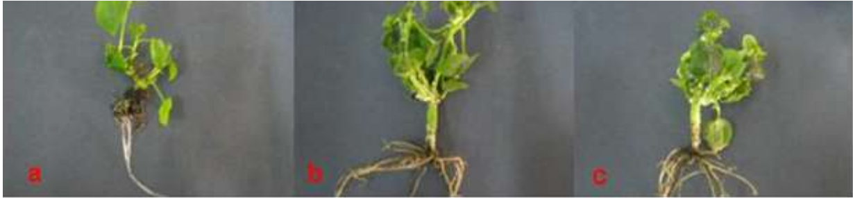
Figure 4. Multiple shoots induction and root formation in three cultivars. a) Sahel genotype, b) Siokra genotype, and c) Hybrid genotype.