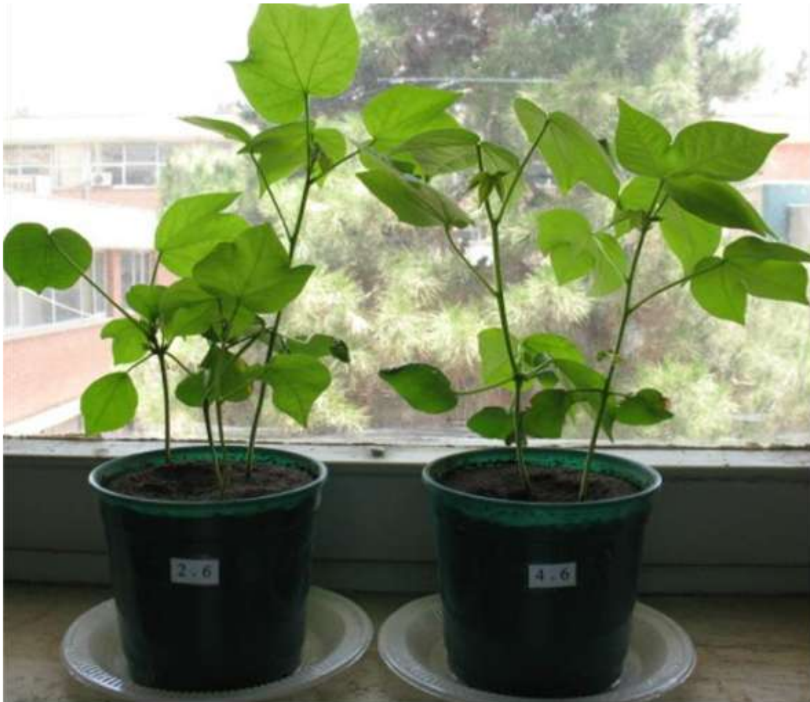
Figure 5. Regenerated plants transferred to soil.

Similarity significant difference in stem length was observed in third, sixth and seventh sub-cultures compared to fourth subculture plants (Table 1).