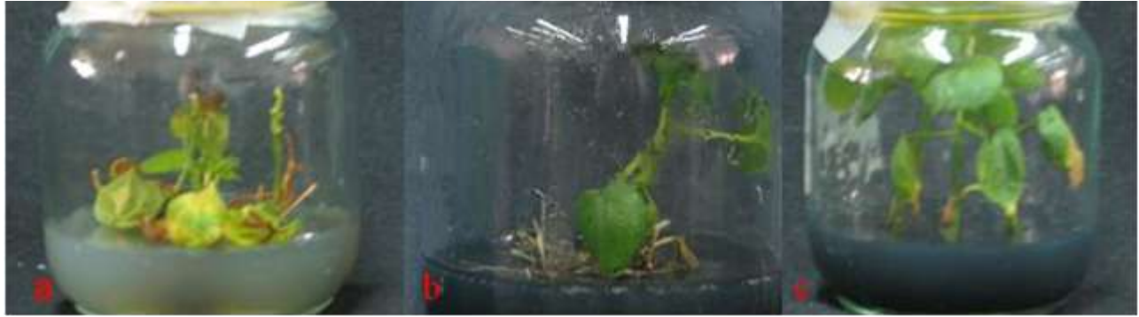
Figure 2. Comparison of three media in multiple shoot formation. a) MS1, b) MS3, and c) MS2.