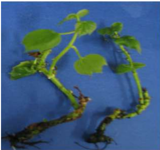
Figure 3. Effect of zeatin in multiple shoot formation.

Siokra genotype showed relatively more survival rate compared to the other two cultivars studied (Figure 5).