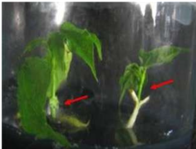
Figure 1. Shoot tip explants development in culture medium.

important cytokinin used in promotion of plant regeneration (Zhang and Wang, 2001; Ikram-ul-Haq, 2005; Lashari et al., 2008). The objective of this study was therefore to optimize the protocol for multiple shoot regeneration based on a modified Murashige and Skoog basal medium and using zeatin as cytokinin and activated charcoal as phenolic-action inhibitor.