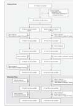
Figure 1. Screening, Randomization, and Follow-up

The treatment period was 12 months in duration and was followed by a 12-month observation period during which no patients received a study drug and all patients remained unaware of their treatment assignment. Spirometry was performed every 3 months during the treatment year and every 6 months during the observation year. Patients who were unable to undergo pulmonary-function (PF) testing at one visit could undergo testing at a subsequent visit. The reasons for withdrawal of patients from the study included a decision to use sirolimus outside the study (3 patients in the placebo group and 5 in the sirolimus group), pneumothorax (2 patients in the placebo group), infection (3 patients in each group), placement on a list for transplantation (2 patients in the placebo group), non-adherence to visits or testing (2 patients in the sirolimus group), rash (1 patient in the sirolimus group), anxiety (1 patient in the sirolimus group), and death (2 deaths in the placebo group, 1 due to stroke and 1 in a house fire). FEV 1 denotes forced expiratory volume in 1 second and LAM lymphangioleiomyomatosis.