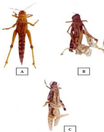
Fig1. Different adult malformations of S. gregaria were produced as a result of the nymphal treatments with N. sativa extracts. A) Normal adult. B) Treated adult with curled legs, incompletely developed short antennae and crumpled wings with transparent posterior area. C) Treated adult with crumpled wings of transparent posterior area and coiled antenna.

Petroleum ether and n-butanol extracts were more potent because different percentages of adult malformations were observed almost proportionally to the concentration (50.0, 14.2, 14.2 and 12.5 at 30.0, 15.0, 7.5 and 3.7 % of petroleum ether extract as well as 40.0, 33.3, 33.3 and 25.0 at 15.0, 7.5, 3.7 and 1.8 of n-butanol extract). The adult deformities could be, generally, assorted in the following features: Adults with curled legs and coiled incompletely developed short antennae. Adults with crumpled wings and transparent posterior area and coiled antennae (Fig.1).