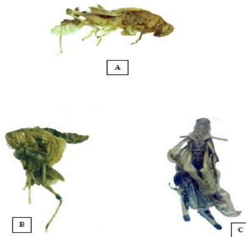
Fig2. Different degrees of adult failure to completely get rid the last nymphal exuvia as a result of the nymphal treatments with N. sativa extracts. A) Nymphal exuvium attached to abdomen, wings and legs. B) Nymphal exuvium attached to wings, legs and mouth parts. C) Nymphal exuvium attached to wings.

deformities at 30 % of petroleum ether extract and 22.2 % adult deformities at 30 % of n-butanol extract (compared to no adult deformities of control adults). Referring to Figs 1 and 2, features of adult impaired morphogenesis program can be observed and described as previously mentioned.