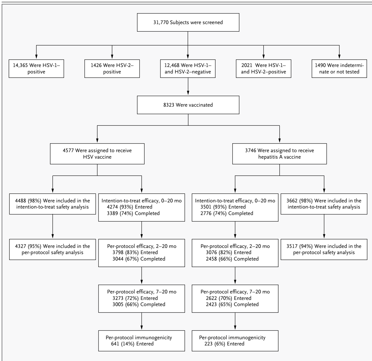
Figure 1. Randomization of Study Subjects.