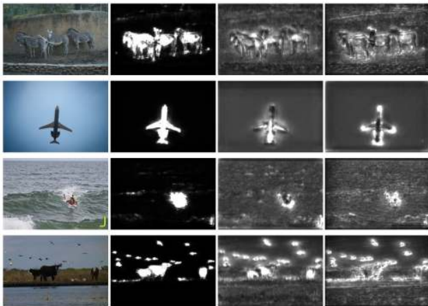
Figure 3. Visualization of global attention maps. The left-most column displays 4 images from MS-COCO 2017. The other three columns show three of the corresponding global attention maps from the efficient attention module at FPN level 1 for each respective example.

attention maps each focusing on a semantically significant area.