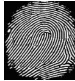
Figure 2: After binarization

Binarization. Nearly all minutiae extraction algorithms function on binary images where there are only two levels of interest: the black pixels that denote ridges, and the white pixels that denote valleys. Binarization is the process that translates a grey level image into a binary image. This enhances the contrast between the ridges and valleys in a fingerprint image, and consequently makes it possible the extraction of minutiae.