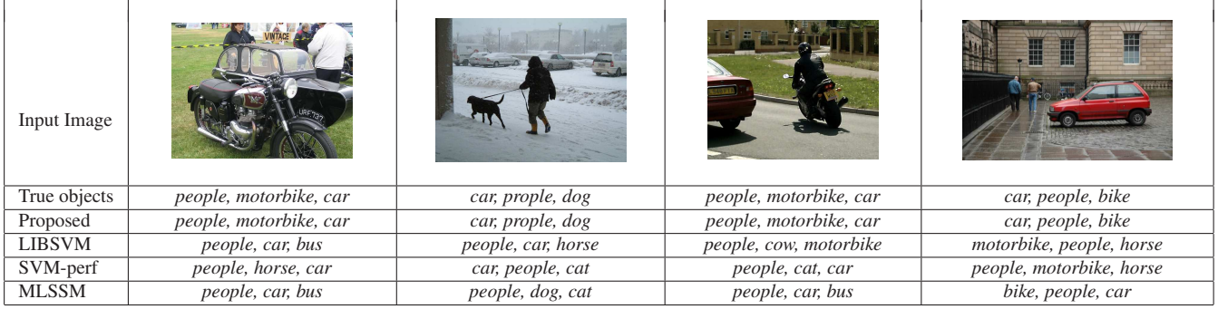
Figure 2. For two images from the dataset, the original lables are given in addition to the outputs of the proposed method and the best method among the rest