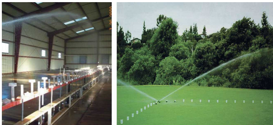
Fig. 1. Indoor (left panel) and outdoor (right panel) single leg sprinkler profile testing of sprinkler uniformity. Catch-cans are spaced equally along a straight line that starts from the sprinkler head and extends beyond the wetted radius of throw of the sprinkler.

Once the profile test is completed, water application uniformity, as measured in the overlap area, can be calculated statistically by using computer programs such as SPACE Pro (Oliphant, 1989). Three common ways of calculating water application uniformity for landscape irrigation include: coefficient of uniformity (CU), distribution uniformity (DU), and scheduling coefficient (SC) (Burt et al., 1997). Historically, CU has been one of the most referenced measures of uniformity in agricultural irrigation (Zoldoske et al., 1994). Because CU fails to distinguish between over- and underirrigated areas, its application to turf irrigation is limited. Thus, DU and SC are the more widely used measures of landscape irrigation uniformity.