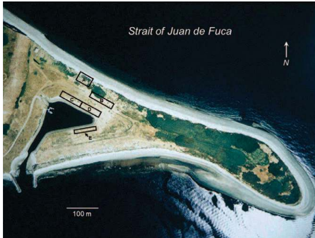
FIGURE 1. Sample Plots (A–E) located in the gull colony on Violet Point, Protection Island. The larger colony extends throughout most of western half of the spit in lightly-shaded areas east, north, and south of the marina.

until the fate of each egg was recorded as cannibalized, eagle depredated (see below), addled, died during pipping, hatched, or other (punctured, nest flooded, or rolled out of nest). For each nest, we determined the distance from its center to the center of the nest of its “nearest neighbor” (Patterson 1965) using a tape measure or laser rule (2006–2010), or a Trimble GPS and ArcGIS Desktop 10 with the “pointdistances” tool in Geospatial Modeling Environment software (2011). We also recorded the habitat type, each of which was readily distinguishable from all others: short or sparse vegetation (non-vegetated substrate or vegetated substrate without American dune grass, Leymus mollis , or gumweed, Grindelia integrifolia ); by a shrub (most commonly gumweed) or a log but not on the beach; beach (cobble and/or log-strewn area from water to base of the short ~0.5-m-high bluff bordering the beach); and beside or in tall grass (American dune grass). In 2007–2011 the mass of each egg was measured on the day it was laid using a 400-g capacity Ohaus Scout Pro SP401 portable electronic balance.