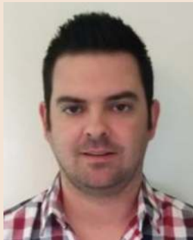
Nico van Rensburg

Abstract: This study sets out to address the perceived pitfalls of egotism among female entrepreneurs in South Africa. This study further ascertains a unique strategy and group of accustomed performance factors that are believed to serve as a cognitive antidote for female entrepreneurs to consistently out-manoeuvre the dangers of egotism. This study adopted a qualitative approach in which 16 achieving female entrepreneurs were purposively selected. The primary data was collected through the application of professionally conducted semi-structured one-on-one interviews and Interpretative Phenomenological Analysis (IPA) served as the primary method of data analysis. Findings from this study prove the significant impact the effects of egotism are believed to have on entrepreneurship and managerial performance as a whole. Aspects such as continuous self-study and the establishment of a disciplined mind both surfaced as invaluable assets. Finally, results also