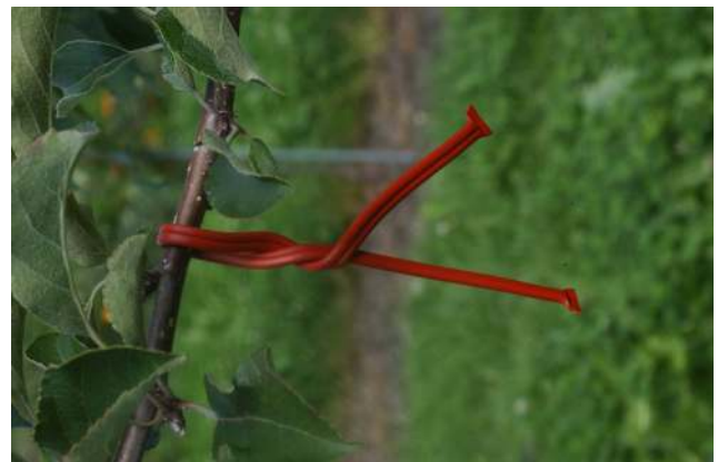
Fig. 6 Principle 4—Pheromone mating disruption is an alternative to chemical control against several lepidopteran pests of fruit