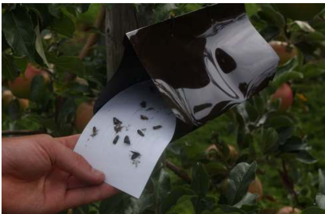
Fig. 5 Principle 2—Pheromone traps are commonly used in orchards to monitor lepidopteran pests of fruit

Spatial and temporal diversification is key to minimizing pest pressure and achieving effective prevention. In organic arable crop farming, crop rotation is the most effective agronomic alternative to synthetic pesticides (Fig. 4). In annual crops, the manipulation of crop sequence to break the life cycle of pests through rotation with crop species belonging to different