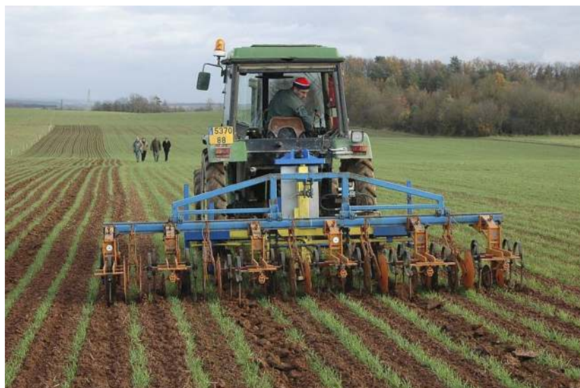
Fig. 7 Principle 4–Mechanical weeding is a major alternative to herbicide use

families is a major lever to strengthen robustness of cropping and farming systems. In this context, robustness refers to stabilizing agronomic performance in spite of disturbances caused by the presence of pests. A diversified crop sequence prevents selection and buildup of the best-adapted pest populations. As a general rule in arable crop rotations, alternating winter and spring-summer crops is recommended as this will break the life cycle of many pests, particularly weeds, more efficiently than a rotation with just winter or summer crops. Similar principles can also be developed for vegetable cropping systems where rotation between leaf and root crops is promoted, while the frequent occurrence of crops within the same botanical family is discouraged. For many specialist fungal pathogens, the selection of different crop families within a rotation effectively reduces pressure. There are other plant pathogens characterized by broad host range that need to be treated differently, however. Such is the case of the bacteria