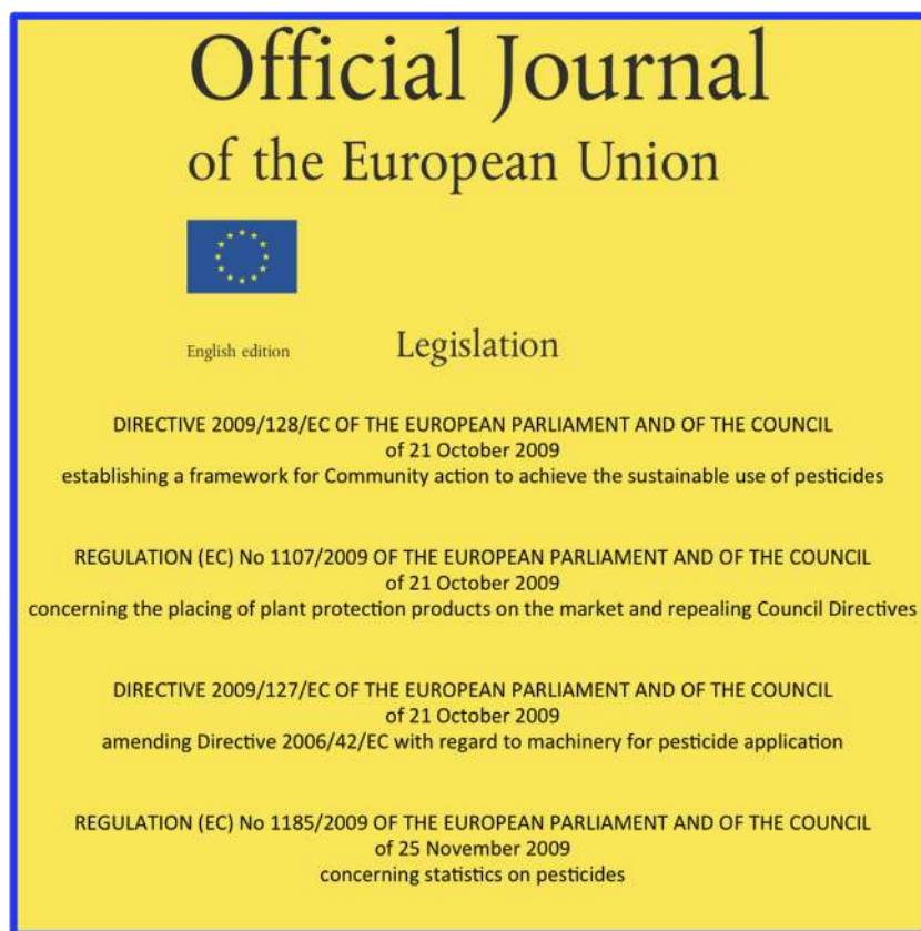
Fig. 2 The suite of 2009 European Union legislation known as “The Pesticides Package”

set up an ambitious demonstration network totaling 1900 commercial and experimental farms in 2012. The network is dedicated to generating and sharing information on the technical and economic feasibility of reducing reliance on pesticides (DGAL 2014). Most arable cropping systems under scrutiny reduced their treatment frequency index by at least 10 %. Economic analyses show no antagonism between pesticide use reduction and profit (Pillet 2014). Germany recently set up a system of demonstration farms in a number of crops where farmers supported by scouts, advisors, and scientists change their cropping practice and voluntarily apply a self-auditing assessment tool (Peters et al. 2013). Initial results from the demonstration farms show that, although labor-intensive, monitoring support and guidance does translate to reduced pesticide use (Freier et al. 2012). The data collected during the 2012–2013 season show that the treatment frequency index in winter wheat, winter barley, and winter oilseed rape was significantly lower in the demonstration farms relative to the reference farms (Peters M. pers. communication). In the UK, the Linking Environment and Farming partnership program has set up demonstration farms and research innovation centers to promote on-farm IPM uptake associated with environmental self-audit tools (LEAF 2013).