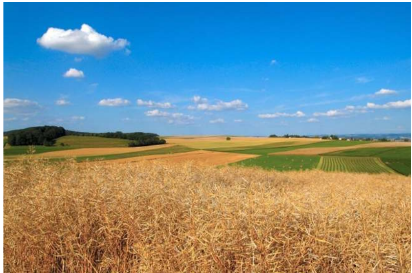
Fig. 4 Principle 1—Diversifying crop rotation in arable crops as a preventive strategy

(Pesticide Use-and-risk Reduction in European farming systems with Integrated Pest Management, www.pure-ipm.eu ) evaluates the feasibility of combinations on six different cropping system types. This European project successfully tested various combinations integrating the following tactics in maize-based cropping systems: foregoing pre-emergence herbicides, establishing a false seed-bed, harrowing at the 2–3 leaf stage, use of low-dose post emergence herbicide, hoeing combined with postemergence band-spraying, and Trichogramma releases against European corn borer, Ostrinia nubilalis (PURE 2013).