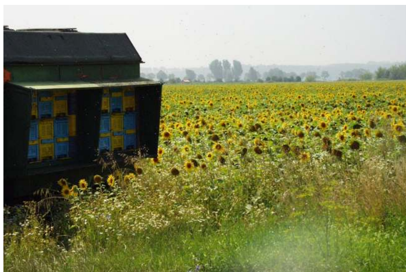
Fig. 8 Principle 5–Protecting honeybees is one criterion used for pesticide selection

Maize-based cropping systems offer an illustration of the importance of crop rotation. Continuous maize cultivation is widespread in Europe for grain production as well as for silage and energy production. Rotation has been demonstrated as key to reducing reliance on pesticides while allowing the successful management of the invasive Western corn rootworm Diabrotica virgifera virgifera as well as several noxious weeds (Vasileiadis et al. 2011). In Europe, the Western corn rootworm can be considered as a pest of a specific maize cultivation system because the complete egg-to-adult development of the pest extends through two maize cultivation cycles. When maize is rotated with a non-maize crop, the cycle of this pest is broken and its population decreases to minimal levels. Because of the multiple on-farm uses of maize