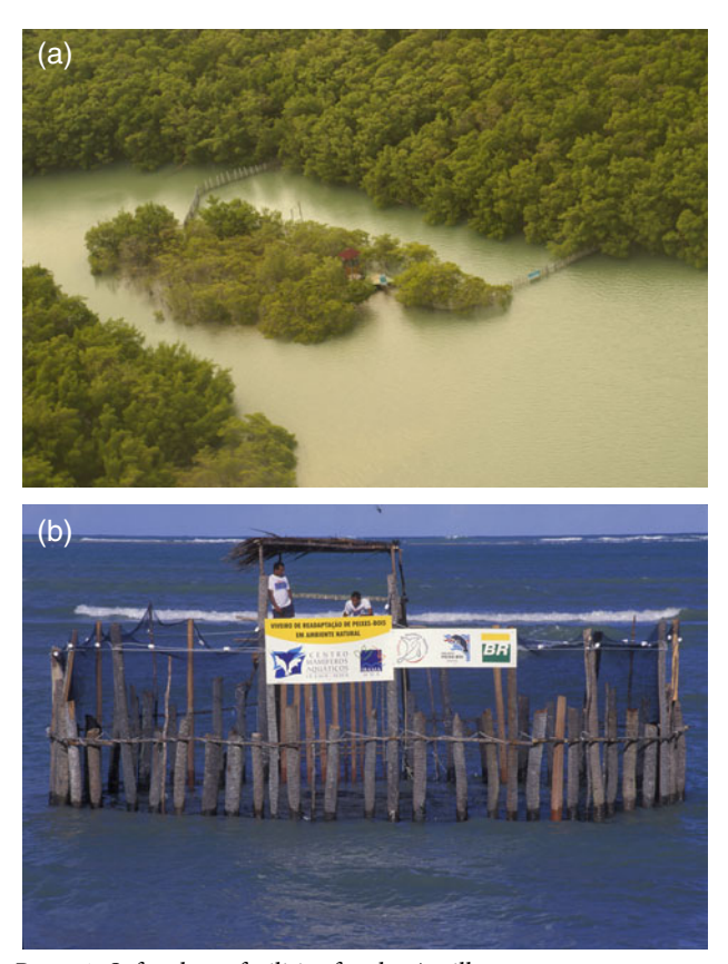
PLATE 1 Soft-release facilities for the Antillean manatee Trichechus manatus manatus built in (a) an estuarine and (b) a marine area.

The criteria used for the selection of individuals for translocation (Table 1) follow the Brazilian Manatee Reintroduction Protocol and the IUCN Reintroduction Guidelines (IUCN, 1998; Lima et al., 2007). After rehabilitation, selected individuals are moved by trucks and boats to staging areas (Plate 1). The manatees spend some time (15 days at the start of the project, increasing to 3–12 months