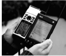
Figure 1: A Palm VII PDA with GPS receiver

To identify individuals with related interests, the agents use an online bibliography service that provides a list of the papers written by an individual. When a person is going to a meeting, their agent can check an online source to locate in-