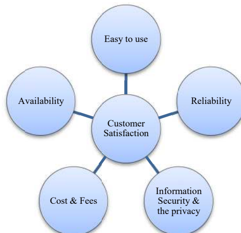
Illustration 1. The 5 variables that have to influence power over customer's satisfaction